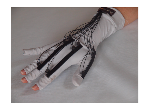
Fig. 2: The sensing glove endowed with three KPF goniometers placed on thumb, index and medium fingers.

previously employed as single layer strain sensors for measuring local fabric deformations due to joint movements [14], [15] or respiration activity [16]. In [6] authors evaluated KPF textile goniometer technology applied to the sensing glove in comparison with a gold standard instrument (Smart DX 100 produced by BTS Bioengineering [17]). The angular errors were in the order of few degrees [6].